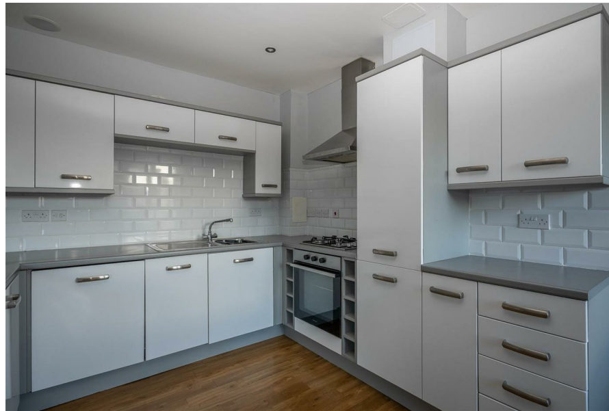
55 Brunel House St, James Road, Brentwood, CM14 4EL

TOTAL FLOOR AREA: 729 sq.ft. (67.7 sq.m.) approx. Measurements are approximate. See for scale. Accuracy guaranteed only. Made with MyPlan 2022